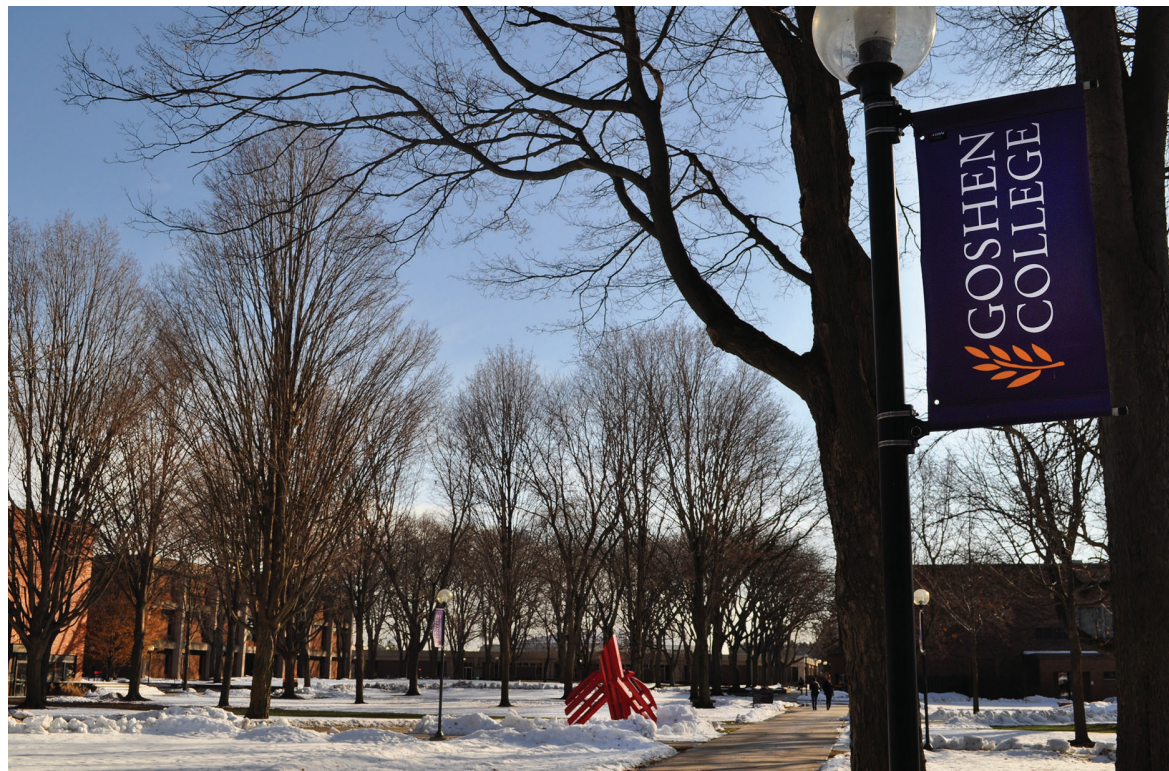
The campus, blanketed in snow, meets the changes of a new year.

"The President's Council knew we were coming to the end of our last strategic planning and were preparing for accreditation,