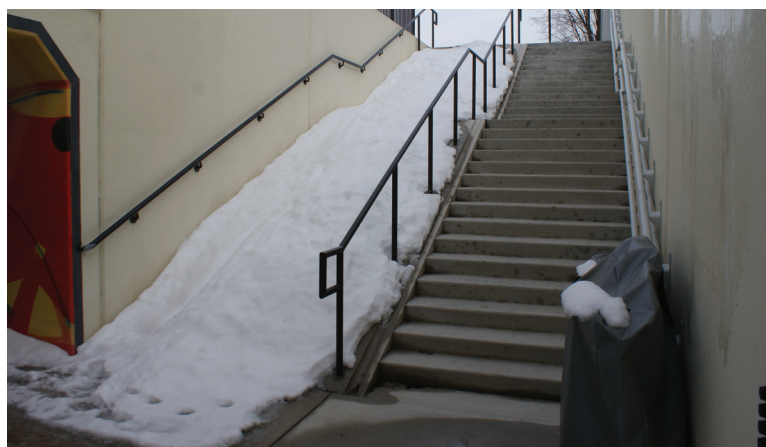
Snow makes half of the underpass impassable.