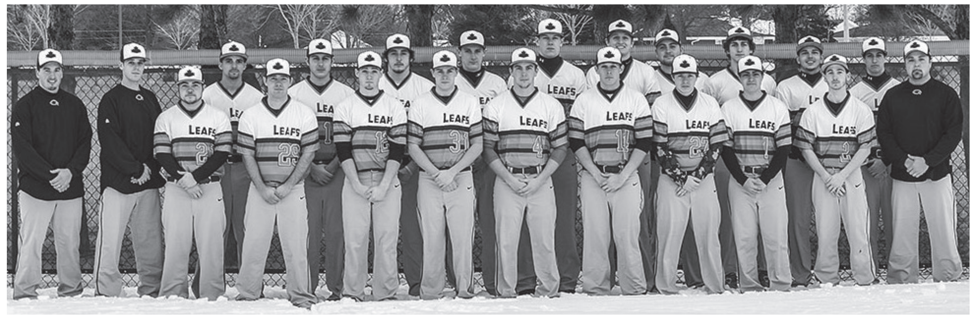
The men's baseball team took home a win last Saturday.