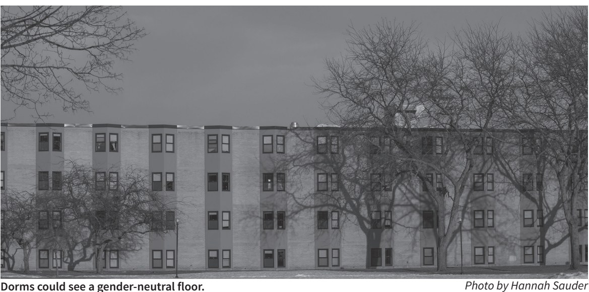
Dorms could see a gender-neutral floor.

believe "this initiative has the opportunity to positively impact admissions, by showing prospective students that Goshen College is welcoming, takes community seriously and has administrators who are open to