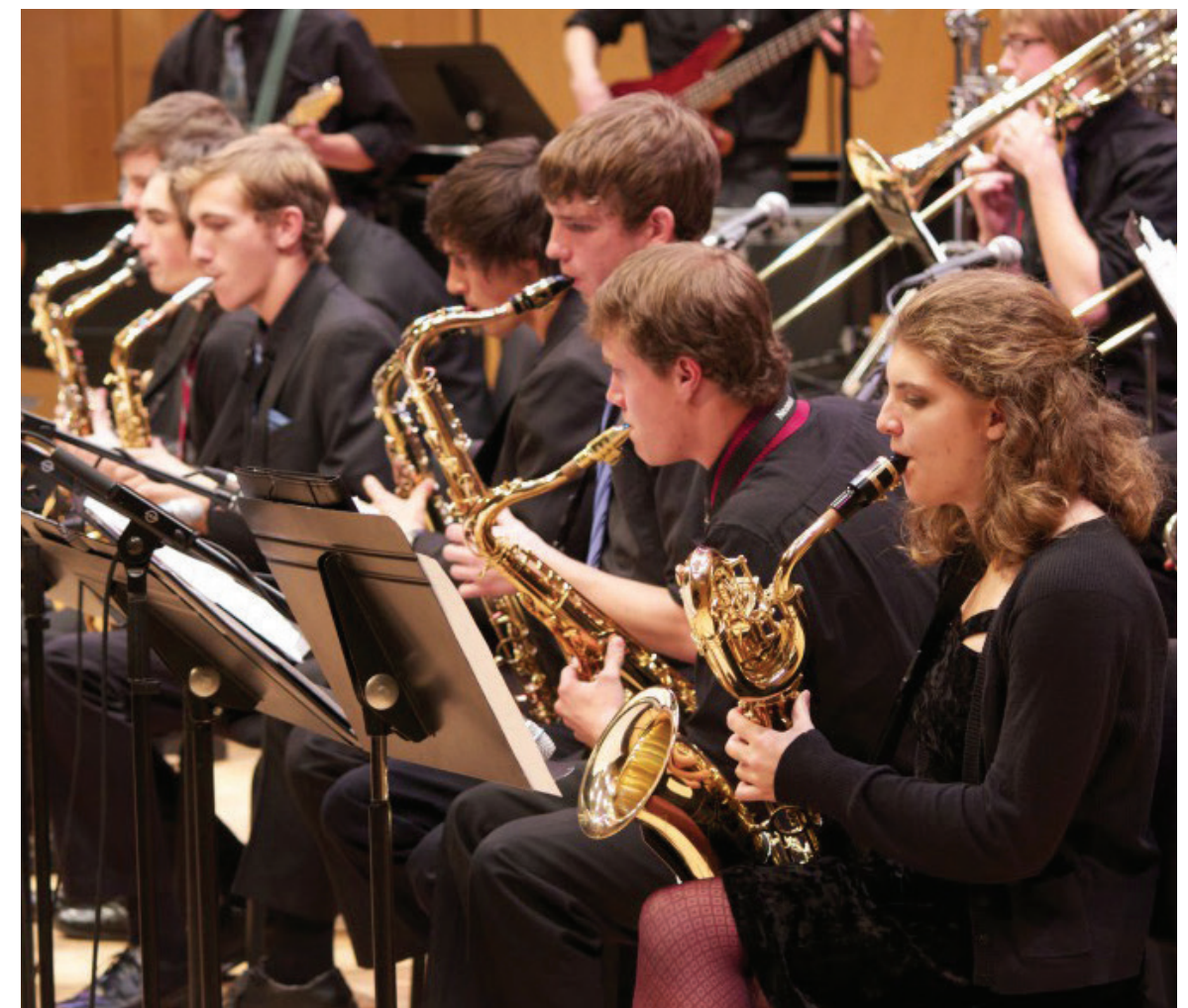
Lavender Jazz performs in Sauder Hall during their fall concert last November. They will perform again on Friday