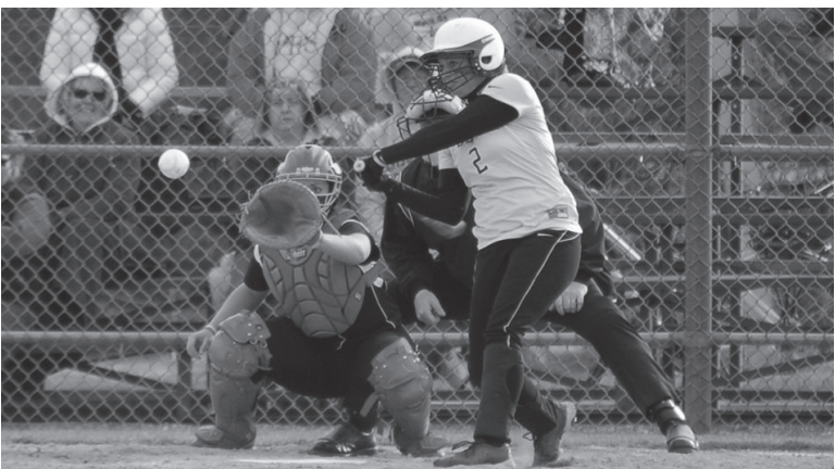
A Goshen softball player winds up for a hit.