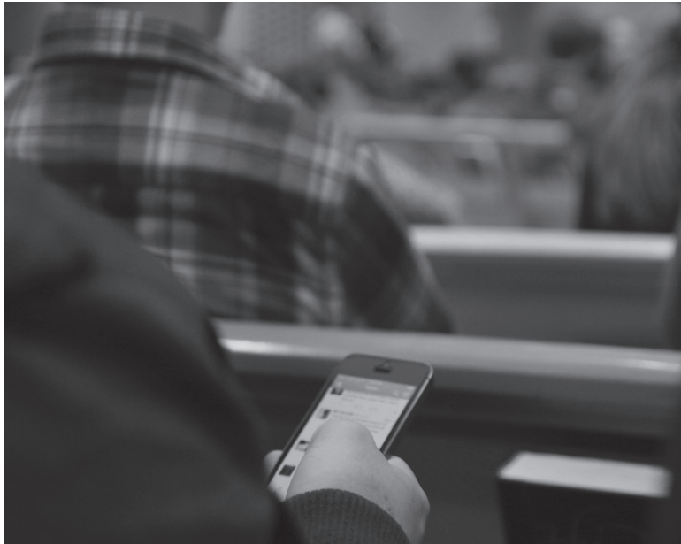
Students pay attention to technology during Monday's convocation.