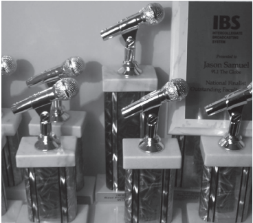
Globe staff won awards.