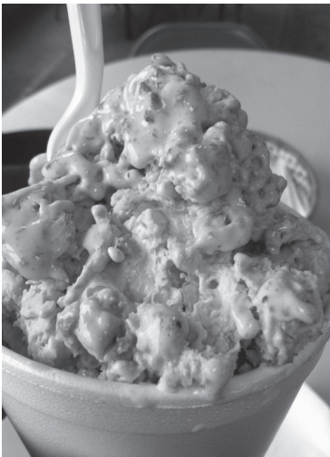
Strawberry ice cream from Rocket Science Ice Cream.

*Yeah, yeah, I know...poor me with all of my California vacations and various ice creams all the time. Ahem.