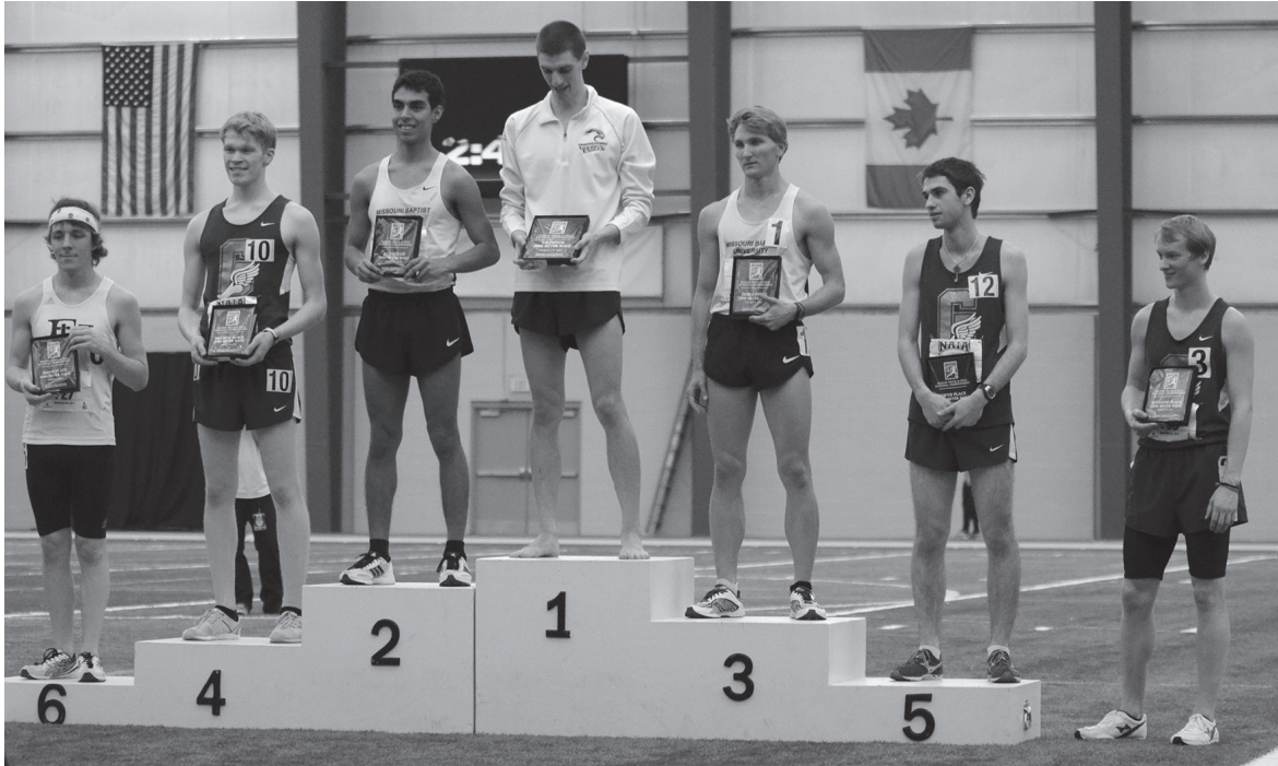
All-Americans were presented awards.

"It was weird for me to get warnings and a red card on my